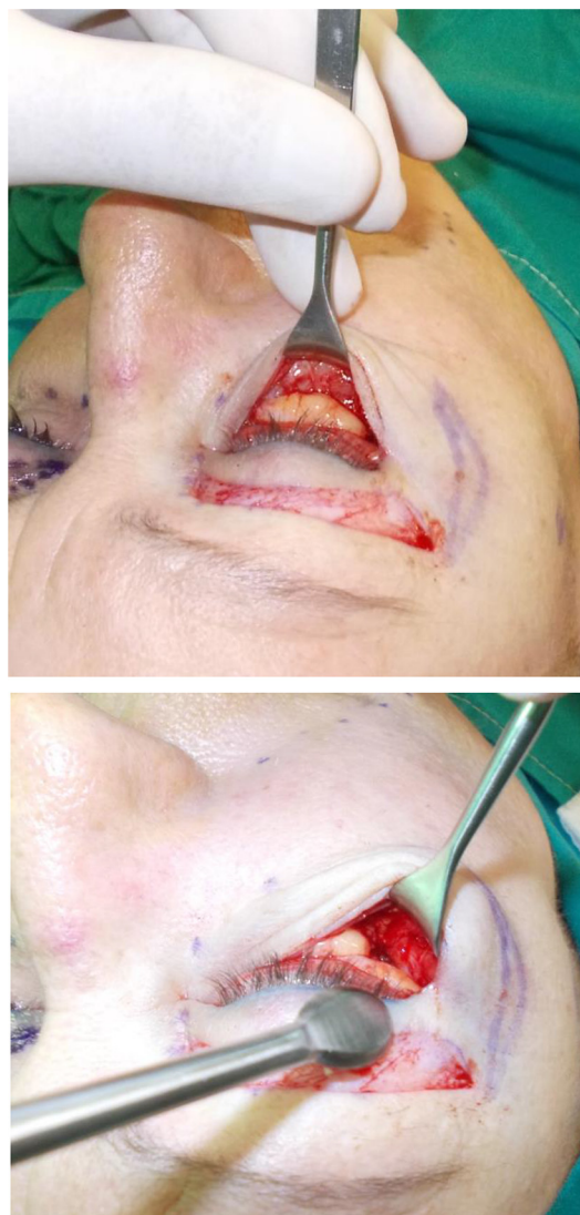
Fig. 1. Photos from the lower eyelid: upper) notice the lower eyelid fat pads before redraping and the inner canthus, lower) notice the rim of the concha before releasing it from the soft tissues with the dissector.

Blunt dissection to the periosteum of the infraorbital rim was performed to release the arcus marginalis and the dissection was extended laterally above the zygomatic bone–arch (Fig. 1). Special