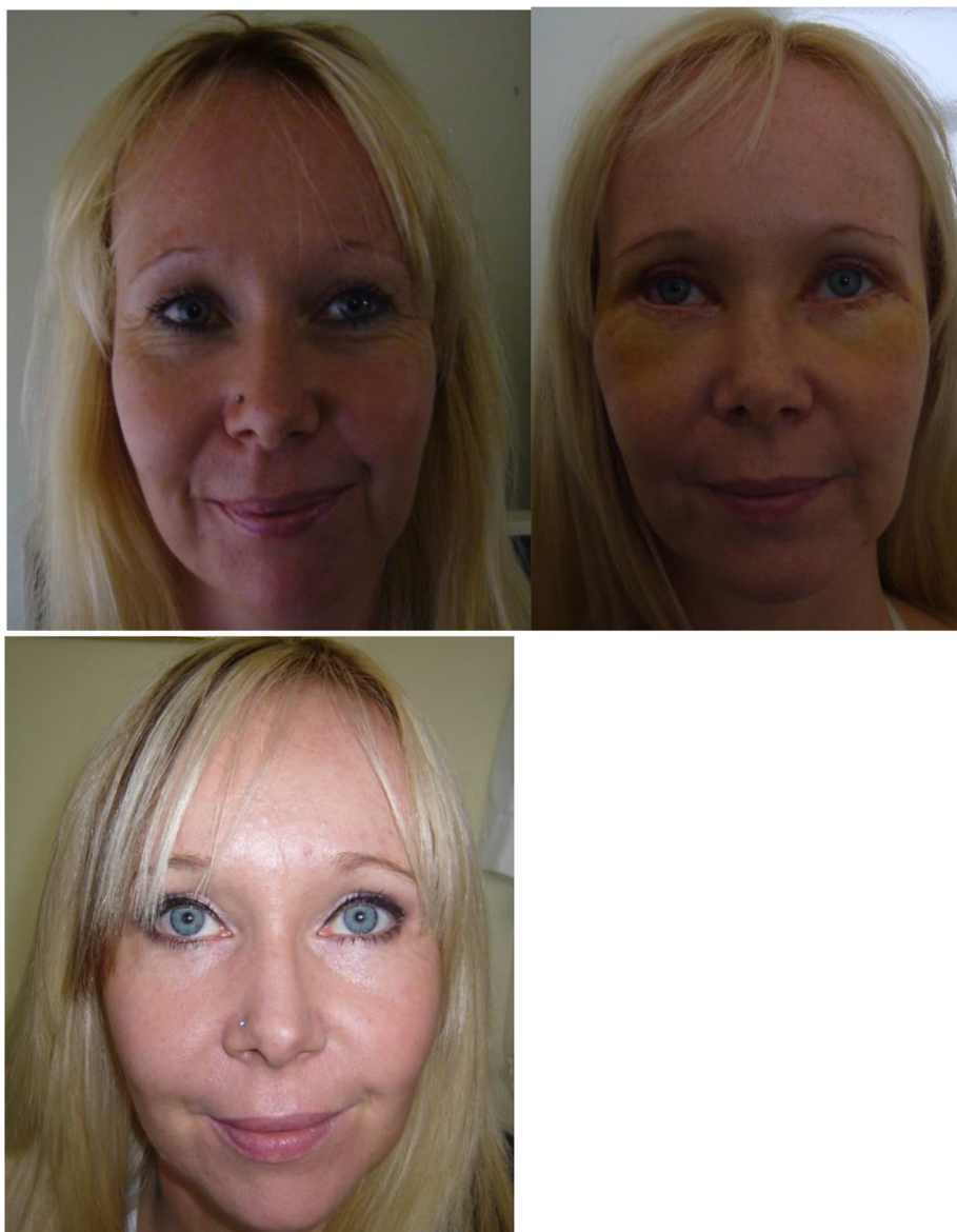
Fig. 7. Patient with tear trough deformity and sagging of the middle face. Photos (left) before, (right) 3 weeks post operatively. Notice the oedema especially under the area of the dissection, (below) 1 year post operatively. Notice the oedema released.

Some patients have malar festoons which can be corrected with our technique. Others do not have bags under their eyes, but instead they have excessive hollowing at the orbital rim. Our technique would be ideal for such cases and can achieve dramatic